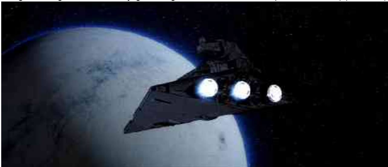
Figure 2 An Imperial Star Destroyer above Hoth

While Hoth appears predominantly white from the ice and clouds, there are dark patches which may be due to the a number of active volcanoes on the surface and mountain ranges which poke their summits up through the ice (SWDBWeb). The average daytime temperature on the surface is -32 degrees Celcius, the nights getting down to -60 degrees (SWDBWeb). This is similar to the range of temperatures experienced throughout the year at Earth's South Pole (recall that the lack of nights during summer and daylight during winter makes direct comparisons difficult) (BASWeb).