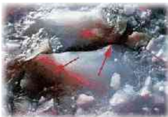
Figure 3 Overturned bits of Antarctic sea ice with algae at the base.

Near the bottom of the food chain is the oceanic algae that live in the ice enclosed oceans. The majority of Earth algae species use photosynthesis as a source of energy, dinoflagellates being the major exception (NMNHWeb). On Earth, algae are known to live inside sea ice (RiceWeb). However, if the depth of the ice covering the oceans is deep enough it is possible that very little, if any, light could be expected to penetrate the ice, ruling out photosynthesis. Perhaps chemosynthetic bacteria with the ability to extract energy from the output of deep sea volcanic vents (VentsWeb) may provide the ultimate source of food.