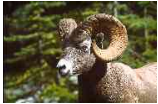
Figure 5 Big horn sheep

Although running on hind legs is not the norm for Earth lizards, it is not unknown – the frill-necked lizard of the Australian desert is one that does so. Bipedal motion may have advantages in an icy landscape as only two feet are in contact with the ground, minimising conductive losses (although the total surface area of the foot may have to increase to support the weight, perhaps nullifying the benefits). The stance of the tauntaun is also at odds with that of Earth lizards, who have a sprawling gait (Lambert et al. 2001).