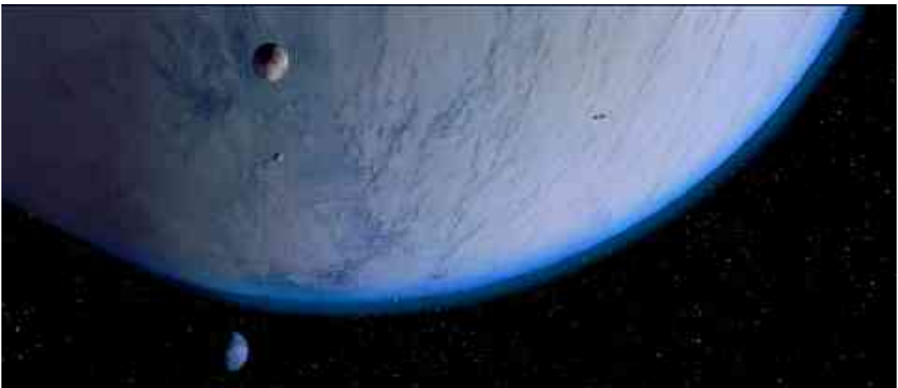
Figure 1 The moons of Hoth

Hoth is a world of ice and snow, a white planet gripped in an extreme ice age. It served as a secret base for the Rebel Alliance during The Empire Strikes Back until the rebels were driven out by an Imperial assault. It is one of six planets of the Hoth system and the only one to support life. (SWDBWeb). Hoth itself has three Moons (Figure 1), which despite their relatively small sizes are massive enough to cause reasonably strong tides in the sub-ice oceans of the southern hemisphere(SWDBWeb).