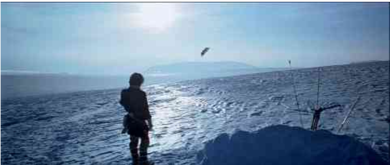
Figure 9 Surface of Hoth, showing its parent star

A “blockage” of solar energy reaching Hoth is one method of reducing the flux received without requiring a change in the output of the star. Tarsia et al (1987) demonstrate that one such mechanisms that has been suggested, the passage of the solar system through a cloud of cosmic dust, will probably not trigger an ice age due to the particle sizes. Further discussion is postponed until a later section.