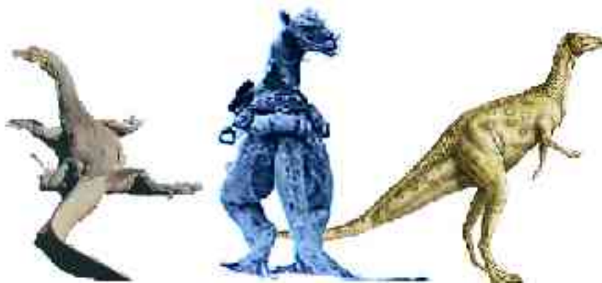
Figure 6 Comparison between a goanna, tauntaun and dinosaur Compsognathus (images courtesy of AdvWeb, DinoWeb, Lucasfilm Ltd)

It does appear as if the term snow lizard is a misnomer for the tauntaun. However, Figure 6 demonstrates possible similarities with a group known as the thunder lizards – the dinosaurs. It is hypothesized that some dinosaurs were warm-blooded, had fur or hair coats (recalling that some evolved into mammals and birds) and some had an upright posture unlike that of lizards (Lambert et al. 2001). The posture of the tauntaun, with its tail hanging limply against the ground, appears to be closer to that of older depictions of erect dinosaurs. Modern portrayals generally display a stiff tail held in an almost horizontal position during forwards movement.