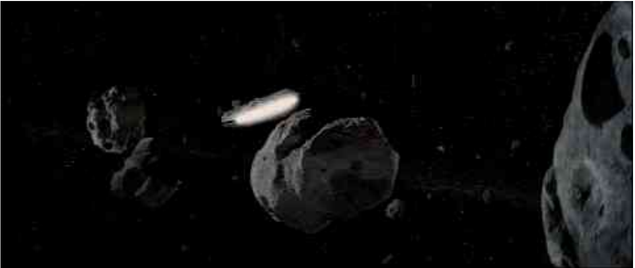
Figure 11 Hoth System's asteroid field

Hoyle (1984) also considered the impact of dust in the planet, both from impacts and interstellar dust clouds, coming up the interesting suggestion that fine particulate matter deposited and suspended in the oceans could increase their albedo.