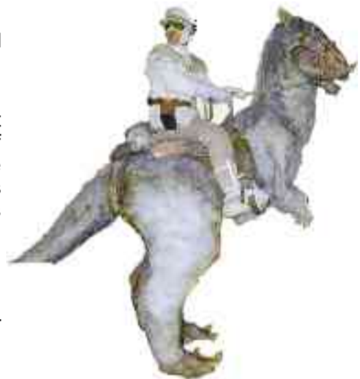
Figure 4 Rebel soldier atop a tauntaun (adapted from Reynolds 1998)

Tauntauns must also differ from Earth reptiles in possessing the ability to generate their own internal heat. We can confirm that the tauntaun does not possess