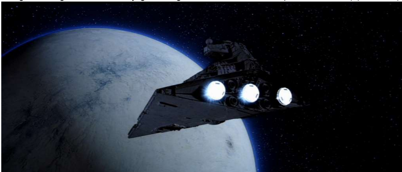
Figure 2 An Imperial Star Destroyer above Hoth

While Hoth appears predominantly white from the ice and clouds, there are dark patches which may be due to the a number of active volcanoes on the surface and mountain ranges which poke their summits up through the ice (SWDBWeb). The average daytime temperature on the surface is -32 degrees Celcius, the nights getting down to -60 degrees (SWDBWeb). This is similar to the range of temperatures experienced throughout the year at Earth's South Pole (recall that the lack of nights during summer and daylight during winter makes direct comparisons difficult) (BASWeb).