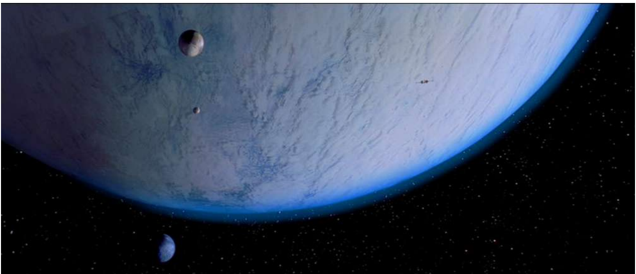
Figure 1 The moons of Hoth

Hoth is a world of ice and snow, a white planet gripped in an extreme ice age. It served as a secret base for the Rebel Alliance during The Empire Strikes Back until the rebels were driven out by an Imperial assault. It is one of six planets of the Hoth system and the only one to support life. (SWDBWeb). Hoth itself has three Moons (Figure 1), which despite their relatively small sizes are massive enough to cause reasonably strong tides in the sub-ice oceans of the southern hemisphere(SWDBWeb).