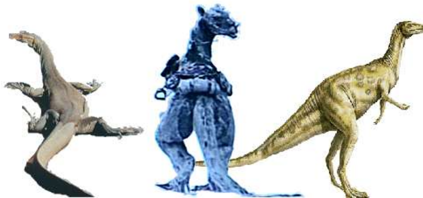
Figure 6 Comparison between a goanna, tauntaun and dinosaur Compsognathus

It does appear as if the term snow lizard is a misnomer for the tauntaun. However, Figure 6 demonstrates possible similarities with a group known as the thunder lizards – the dinosaurs. It is hypothesized that some dinosaurs were warm-blooded, had fur or hair coats (recalling that some evolved into mammals and birds) and some had an upright posture unlike that of lizards (Lambert et al. 2001). The posture of the tauntaun, with its tail hanging limply against the ground, appears to be closer to that of older depictions of erect dinosaurs. Modern portrayals generally display a stiff tail held in an almost horizontal position during forwards movement.