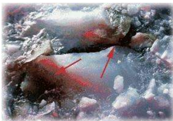
Figure 3 Overturned bits of Antarctic sea ice with algae at the base. Photograph (courtesy of Charlotte Kelchner, Rice University)

Near the bottom of the food chain is the oceanic algae that live in the ice enclosed oceans. The majority of Earth algae species use photosynthesis as a source of energy, dinoflagellates being the major exception (NMNHWeb). On Earth, algae are known to live inside sea ice (RiceWeb). However, if the depth of the ice covering the oceans is deep enough it is possible that very little, if any, light could be expected to penetrate the ice, ruling out photosynthesis. Perhaps chemosynthetic bacteria with the ability to extract energy from the output of deep sea volcanic vents (VentsWeb) may provide the ultimate source of food.