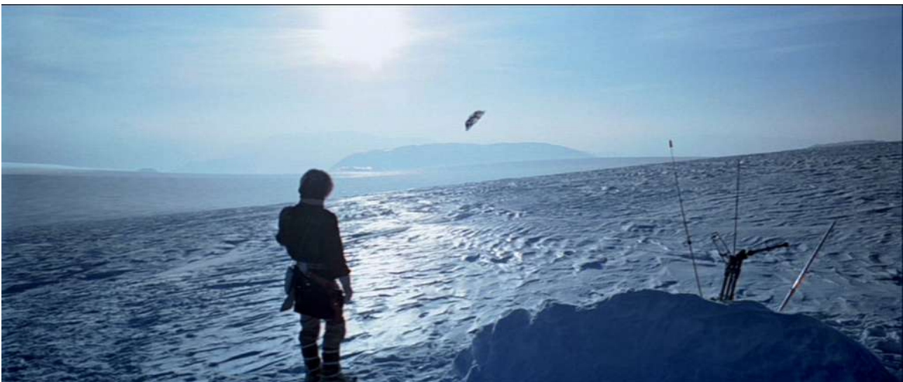
Figure 9 Surface of Hoth, showing its parent star

A “blockage” of solar energy reaching Hoth is one method of reducing the flux received without requiring a change in the output of the star. Tarsia et al (1987) demonstrate that one such mechanisms that has been suggested, the passage of the solar system through a cloud of cosmic dust, will probably not trigger an ice age due to the particle sizes. Further discussion is postponed until a later section.