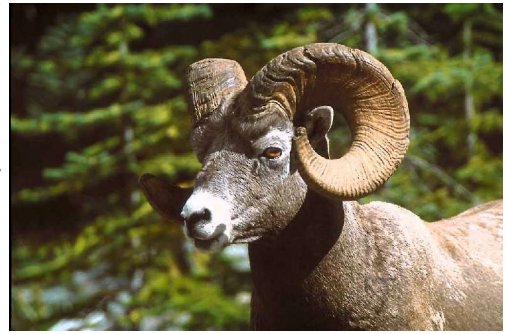
Figure 5 Big horn sheep

Although running on hind legs is not the norm for Earth lizards, it is not unknown – the frill-necked lizard of the Australian desert is one that does so. Bipedal motion may have advantages in an icy landscape as only two feet are in contact with the ground, minimising conductive losses (although the total surface area of the foot may have to increase to support the weight, perhaps nullifying the benefits). The stance of the tauntaun is also at odds with that of Earth lizards, who have a sprawling gait (Lambert et al. 2001).