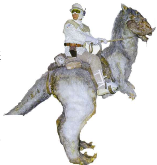
Figure 4 Rebel soldier atop a tauntaun (adapted from Reynolds 1998)

Tauntauns must also differ from Earth reptiles in possessing the ability to generate their own internal heat. We can confirm that the tauntaun does not possess some weird internal chemistry that allows it to function in near thermal equilibrium with the external atmospheric temperature by the scene in The Empire Strikes Back where hypothermic Luke