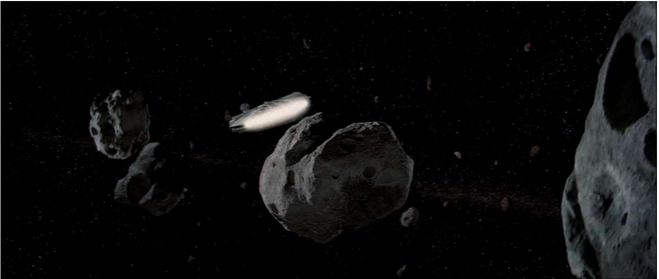
Figure 11 Hoth System's asteroid field (© Lucasfilm Ltd)

Hoyle (1984) also considered the impact of dust in the planet, both from impacts and interstellar dust clouds, coming up the interesting suggestion that fine particulate matter deposited and suspended in the oceans could increase their albedo.